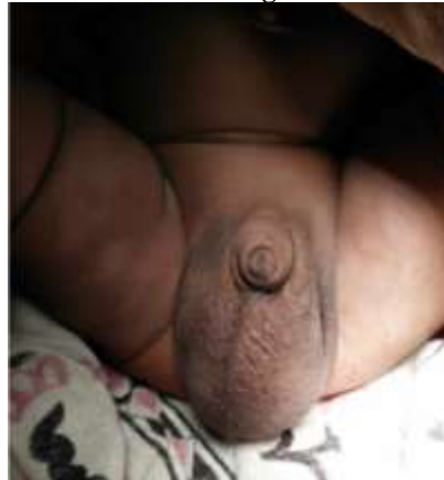
Figure 1: Diffuse scrotal swelling clinically ascribed to bilateral hydroceles