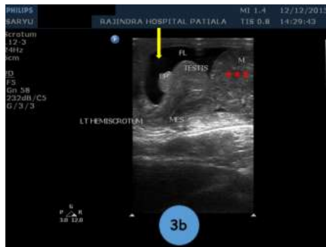
Figure 3b: Paratesticular mass (**red triple asterisk) is seen closely abutting but separable from the left testis. Fluid is seen in the tunica vaginalis cavity (yellow arrow)